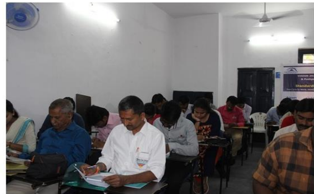
Participants taking the pre assessment