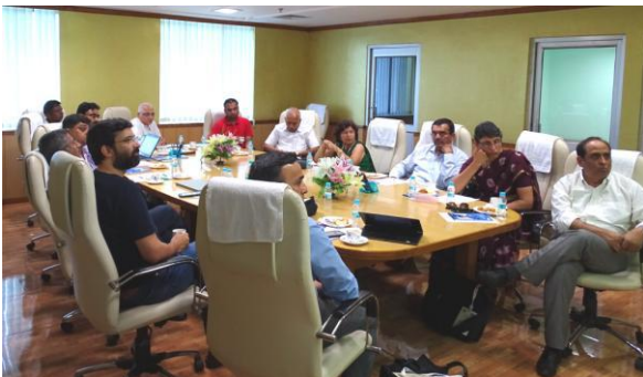
The 58 th Board Meeting in progress at Guwahati on 8 June 2018