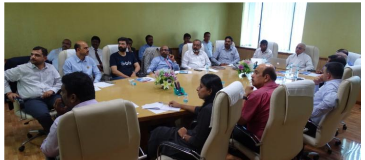
The Corporate Advisory Board meeting was held on 8 June 2018 at Guwahati