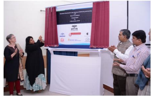
SCALE programme being formally launched

SCALE – Strengthening Capacity and Learning to Effectively Deliver Quality Eye Care was launched at Dr Shroff Eye Hospital, Delhi on 3 December, 2016. This is an initiative of SEVA Foundation and Seeing is Believing. The aim of the project is to scale up comprehensive quality eye care services through capacity building, directly increasing sight restoration in India by 2020.