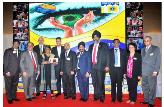
Members of the Lion family