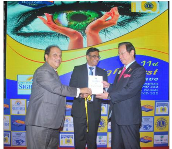
"Sight First Hospital Manual" being released