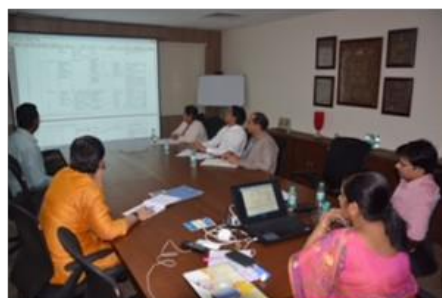
Quality Review class in progress