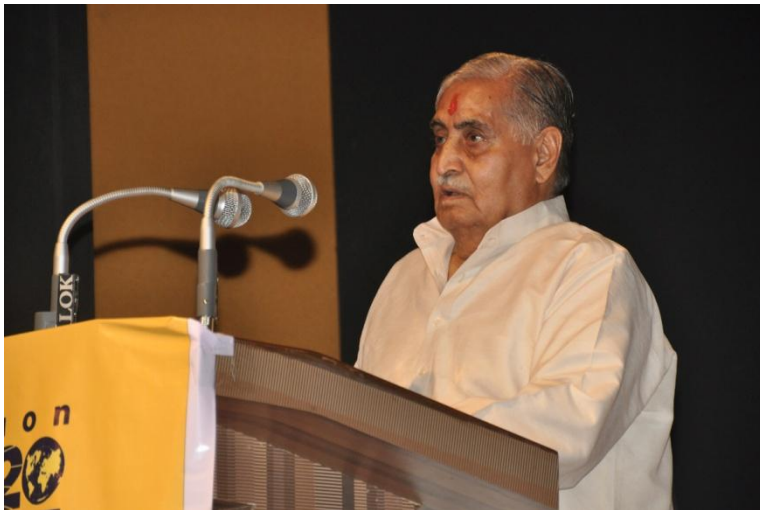
Chief Guest for the inaugural, Shri Kailash Joshi addressing the audience