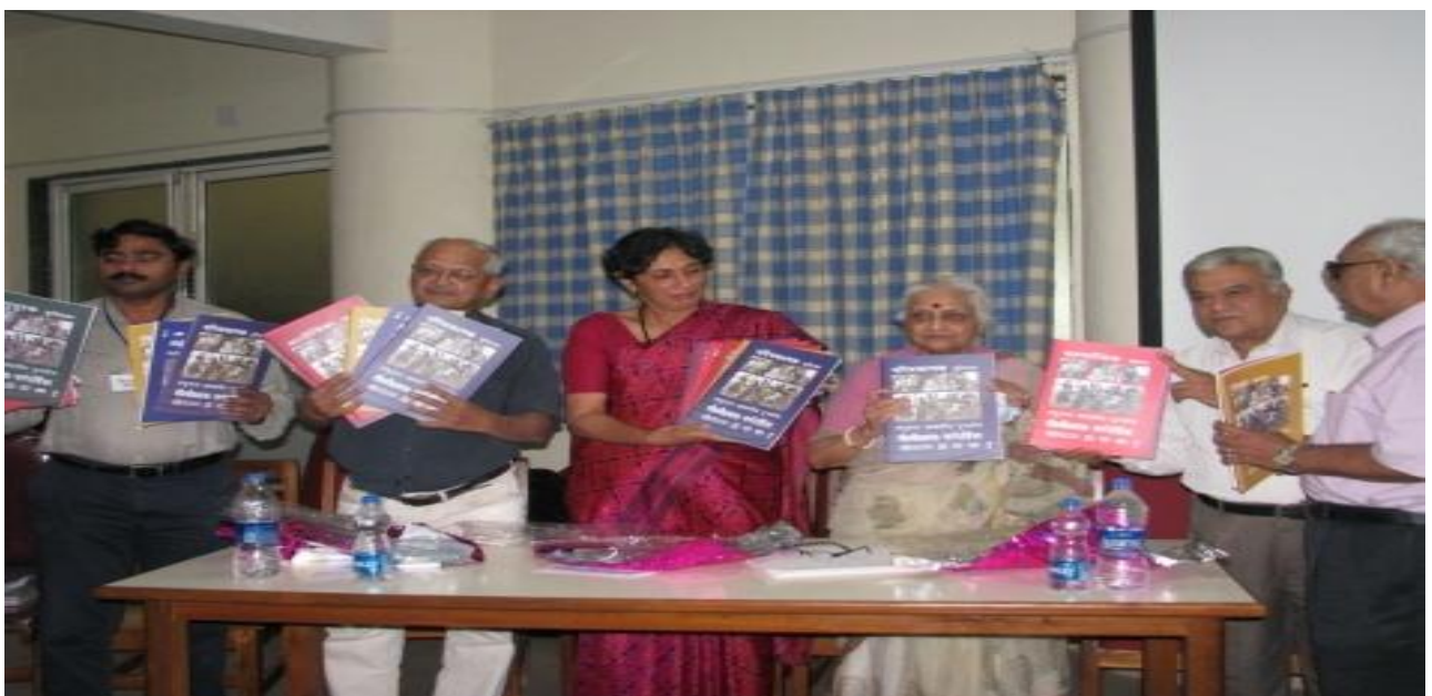
Release of CBR Guideline in Hindi