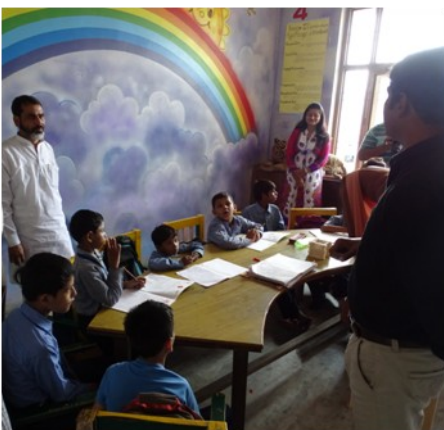
A class in progress at Kalyanam Karothi