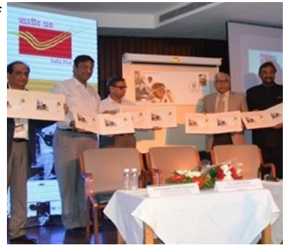
Sightsaver's 50years celebration

Meeting at Sightsavers: Secretariat team participated in celebration of Sightsavers completing their 50 years of successful services in INDIA. The programme was organised by Sightsavers on 30 August 2016 at IIC, New Delhi.