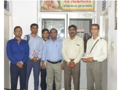
At Bhakti Vedanta Hospital, Barsana

Bhakti Vedanta Hospital, Barsana - While the head hospital is located in Mumbai, the hospital in Barsana is a branch. The team visited the hospital and met two doctors and discussed about the hospital's functioning. It is a small unit and cannot accommodate more than 70 patients per day. A plan exists to construct a new and bigger hospital in their 4 acres land in Barsana. We explained about VISION 2020 – INDIA's role and accomplishments. The doctors expressed their concern about pending amounts from DBCS and no cooperation from the DBCS authorities. We explained the advocacy that we have been making at national level, in this regard. It was a very fruitful meeting, overall.